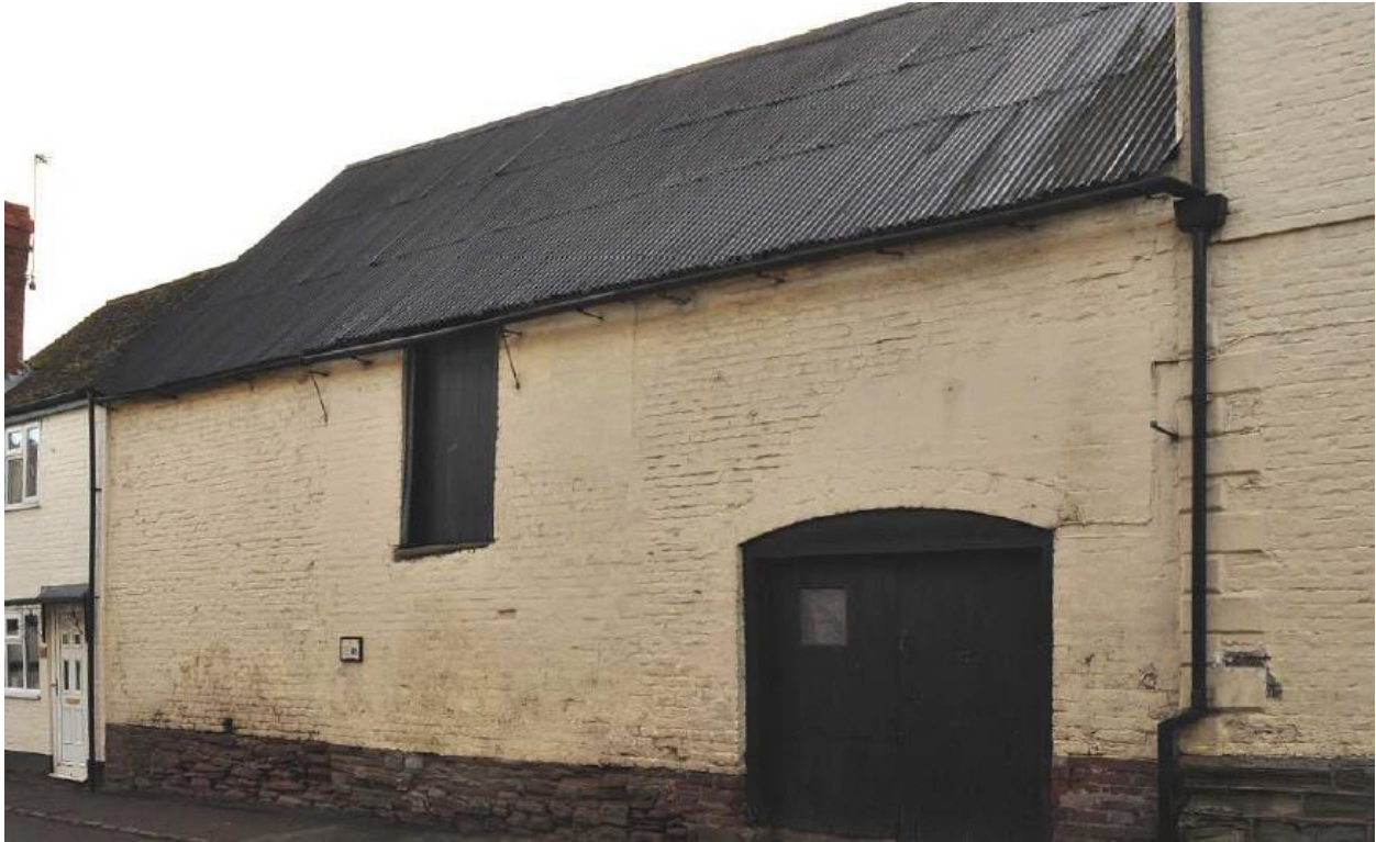
Figure 4: Subject barn prior to conversion showing an absence of openings to the roof slope

6.14 Applicant response 18/10/20 and 02/11/20: The description of what characterizes agricultural barns above is a generalization and inaccurate where the barn at No. 3 High Street is concerned.