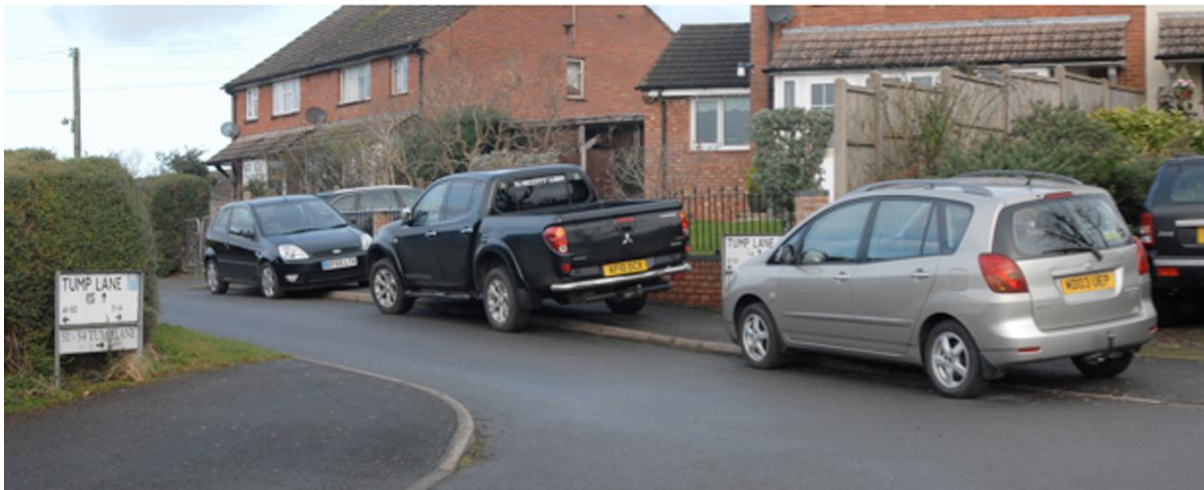
Schedule of Committee Updates

A minimum of 14 Tump Lane resident's cars will be displaced from existing parking facilities. No one has been offered alternative parking. Tenants of over 50 years to be evicted from their rented garages before demolition and their vehicles displaced to find roadside parking. These "evicted" tenants will probably seek parking in the immediate vicinity around the only entrance to the site where householders routinely park on the pavement of this narrow road