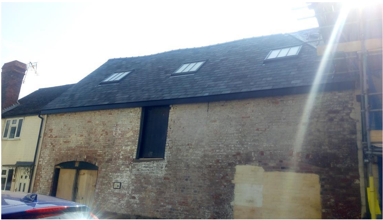
Figure 3: Roof lights in situ when viewed from northern side of High Street

6.13 Applicant response 18/10/20: the Applicants have supplied photographs taken from a number of vantage points along High Street. The rooflights are not visible from the westbound carriageway and pavement of High Street, and are only partially visible from an oblique angle along the Eastbound carriageway and pavement of High Street.